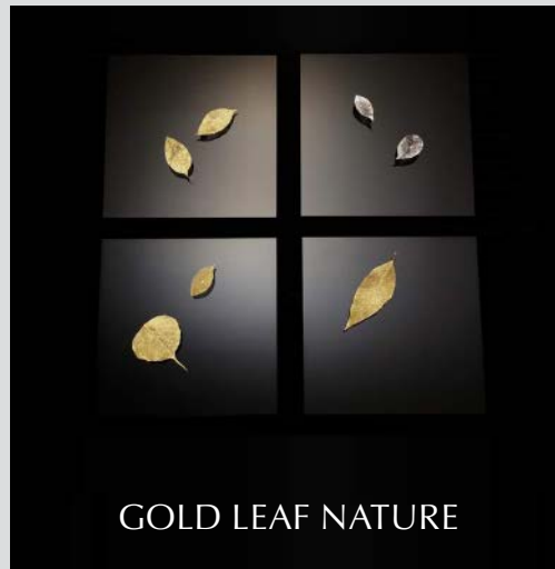
GOLD LEAF NATURE