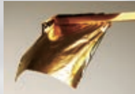
Beauty pursued by craftsmen