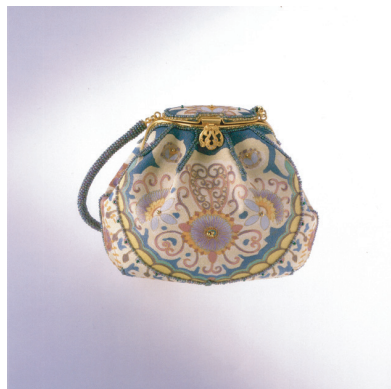
Above is the handbag that Empress Michiko purchased in Kyoto. Princesses Masako and Kiko, and Mrs. Sayako Kuroda (ex-princess) also own this type.