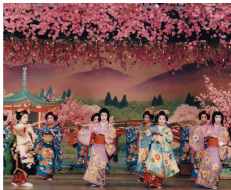
OKAJIMA has been making geiko and maiko kimono costumes for the <Miyako Odori, > one of Kyoto's spring events, since the Meiji Era year 5 (1872).