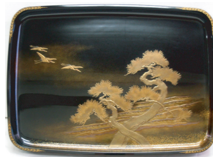
Eminent Japanese painters such as Kiyotaka Kaburagi, Seiho Takeuchi, Sekka Kamisaka, and Ryuou Kishida designed for OKAJIMA's products when they were still young and obscure. Due to a good friendship with Kamisaka, the company keeps some of his works.